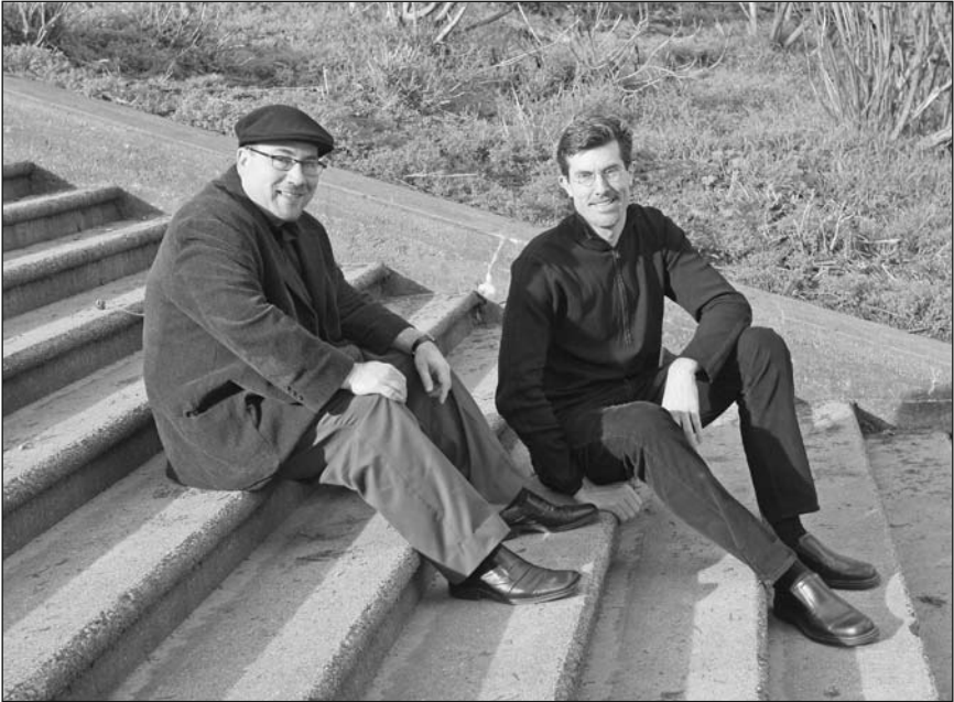
Craig Newmark and Jim Buckmaster, circa 2005

Newmark: Trust your instincts and your moral compass. I've used that phrase too much in this conversation. The deal is: we're not pious about this. We try hard not to be sanctimonious. This is the way people really live; we just don't talk about it. I'd prefer to be cynical and not talk about it, and yet, that's real life.