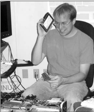
Repairing the disk electronics on an early Gmail prototype.