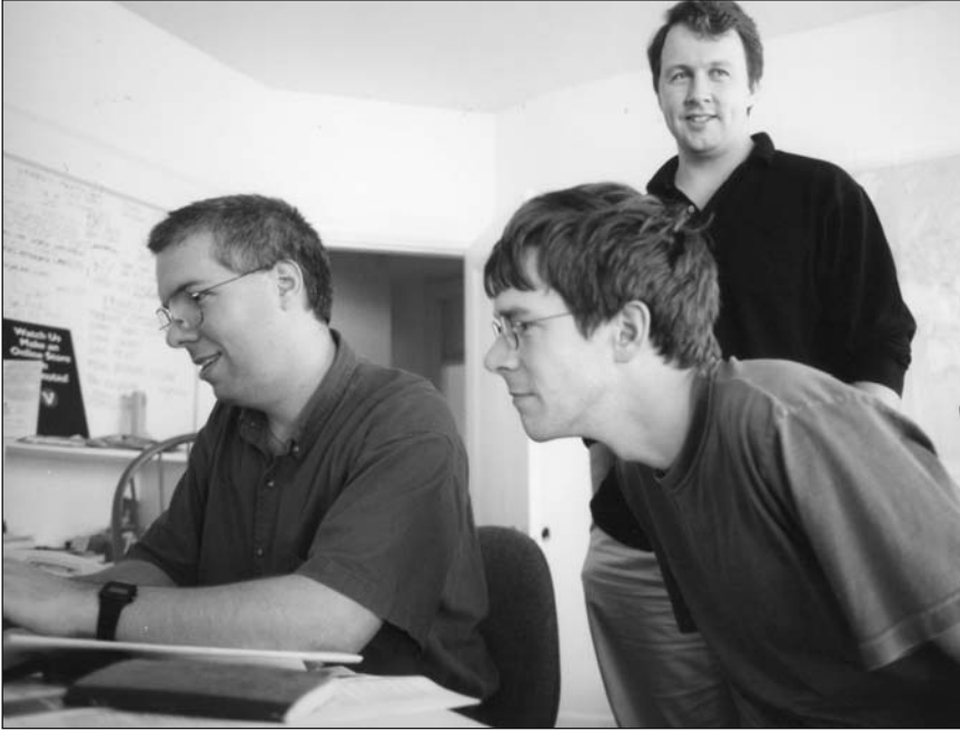
Trevor Blackwell, Paul Graham (standing), and Robert Morris in 1996

Graham: Oh yeah. In fact, I don't know how people who haven't done it can pick founders. How can they tell? I often see people who seem kind of clueless, and I can remember, "Yeah, we seemed clueless in exactly the same way." So those are the guys we invest in.