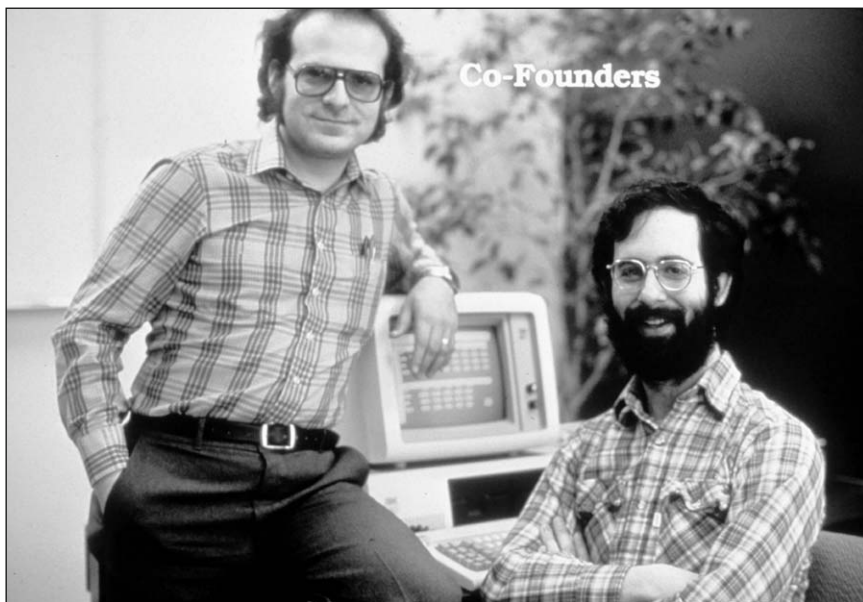
Bob Frankston (standing) and Dan Bricklin, circa 1982

Even though it seems like it’s big business and impersonal, and “they” take care of it, it really isn’t. There is no “they.” It always comes down to an “I” of somebody, and in many cases, it’s a principal.